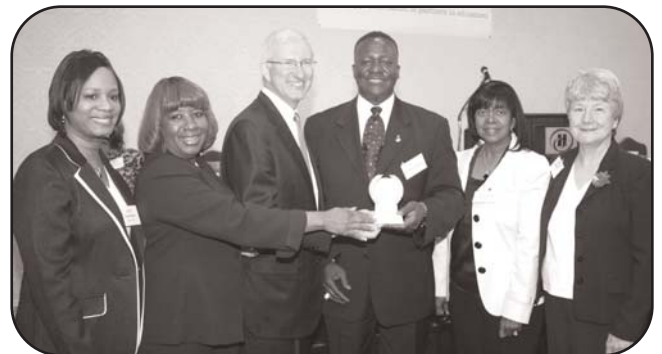
Partnership Excellence Award: George Street Elementary and Fondren Baptist Church, Colonial Heights Baptist Church, Hinds County Sheriff's Dept. and Battlefield Neighborhood Association