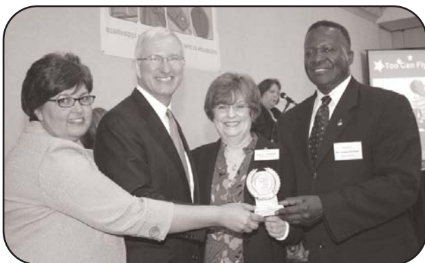
Partnership Excellence Award: Jackson Public Schools - Developing Community Partnerships