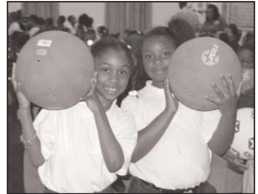
Marshall Elementary students received a variety of sports balls, which were theirs to keep!