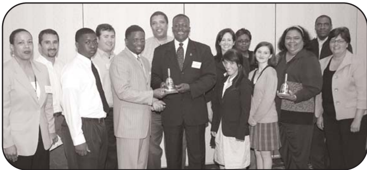
Governor's Award: Wingfield High School Entergy Scholars Program