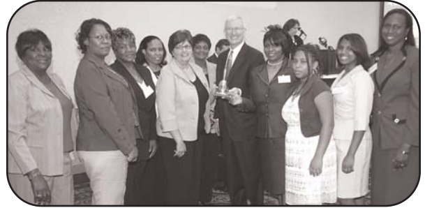
Governor's Award: Moss Point School District and Moss Point Visionary Circle, Inc.