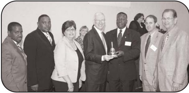
Governor's Award: Jackson Public Schools Transformation Jackson Shine '09