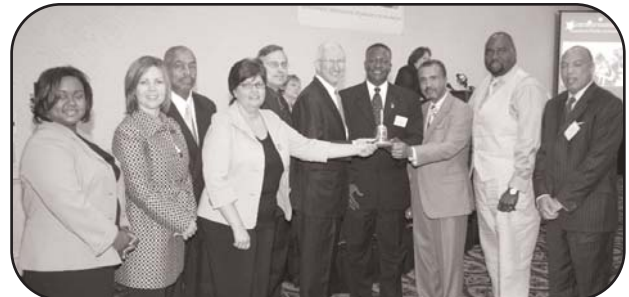
Governor's Award: Rowan Middle School I Too Can Fly Program