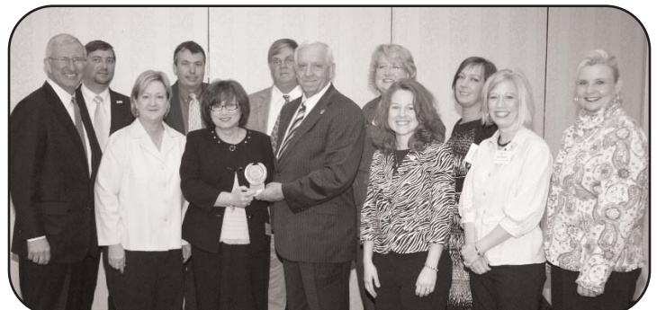
Partnership Excellence Award: Thomas Street Elementary (Tupelo) and Mississippi Department of Transportation