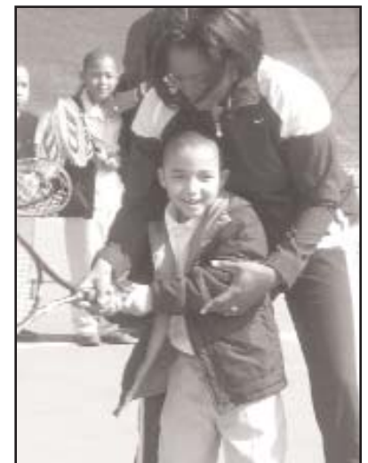
Volunteers from the Mississippi Tennis Association presented demonstrations to students.