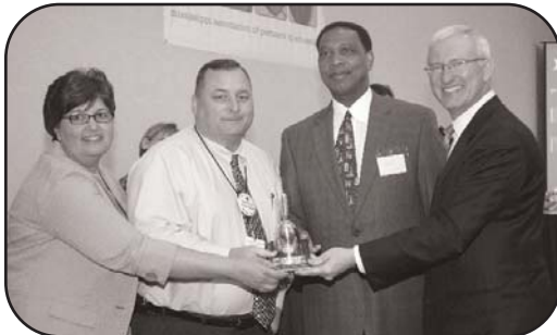
Governor's Award: Pascagoula School District Family Interactive Center